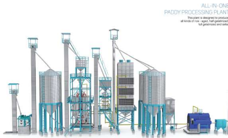
ALL-IN-ONE PADDY PROCESSING PLANT This plant is designed to produce all kinds of rice - aged, half-gelatinized, full-gelatinized and sella.